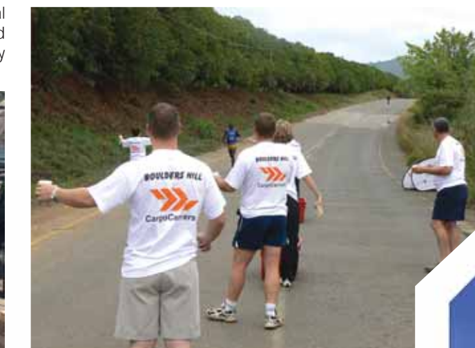
The second annual "Cargo Carriers Boulders Marathon" kicked off from Mara in Mpumalanga on the 27th October 2007. Attracting approximately 150 runners, participants transversed the area's mountainous regions, ending in Kaapmuiden.