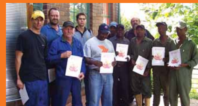
The Sasolburg "Fire Fighters" - Staff from the Sasolburg Branch successfully completed their Fire Fighting Course