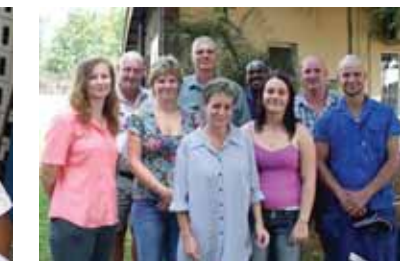
Malelane branch staff