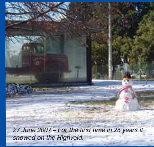
27 June 2007 - For the first time in 26 years it snowed on the Highveld.