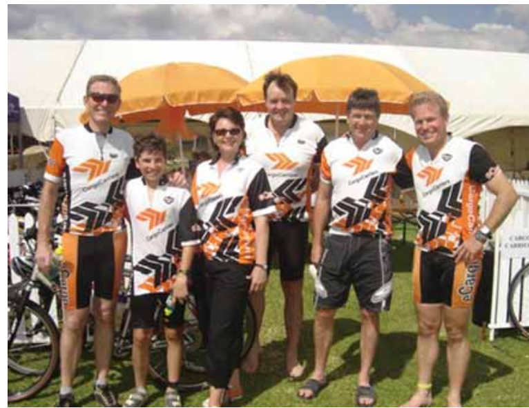
Commitment - the Cargo Carriers Team also participated in the 94.7 Cycle Challenge held in Johannesburg on 18 November.