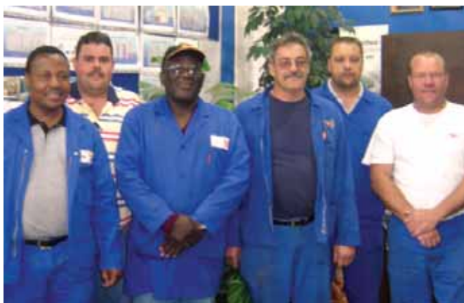
The Workshops Team