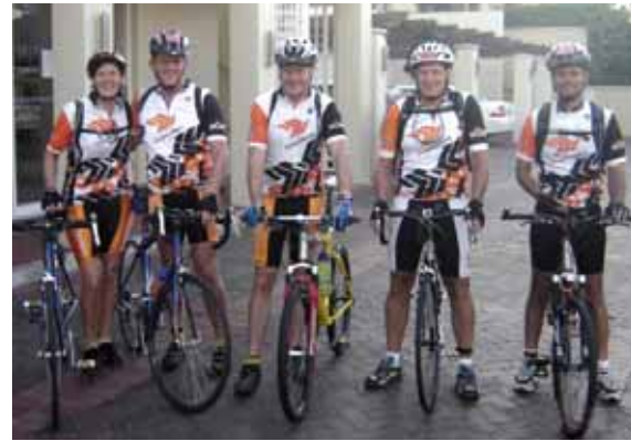
Well done to the Cargo Carriers Cycling team who participated in this year's Argus Cycle Challenge!