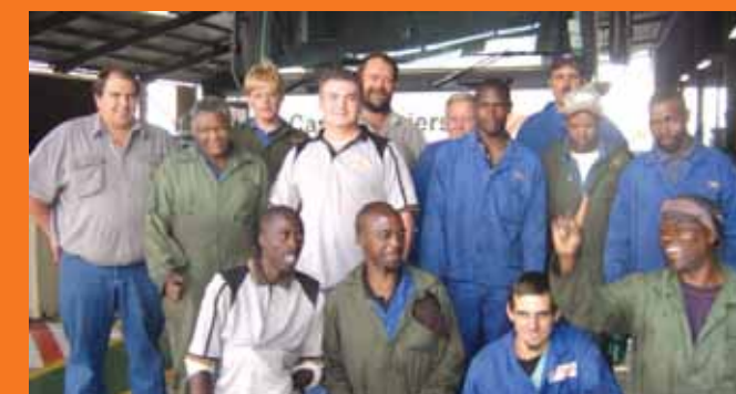
Sasolburg Workshops Team