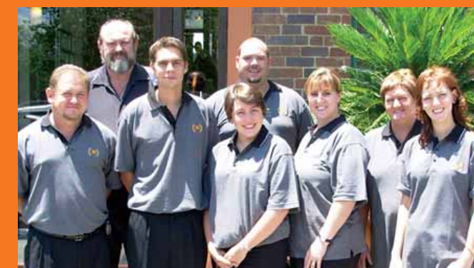
New faces at Sasolburg