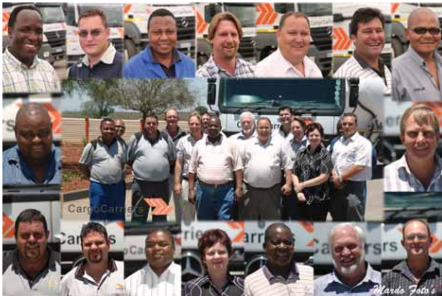
Steel and Powders Team